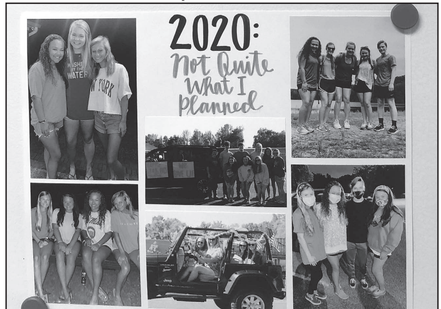
2020: Not Quite What I Planned by Emma Dickey