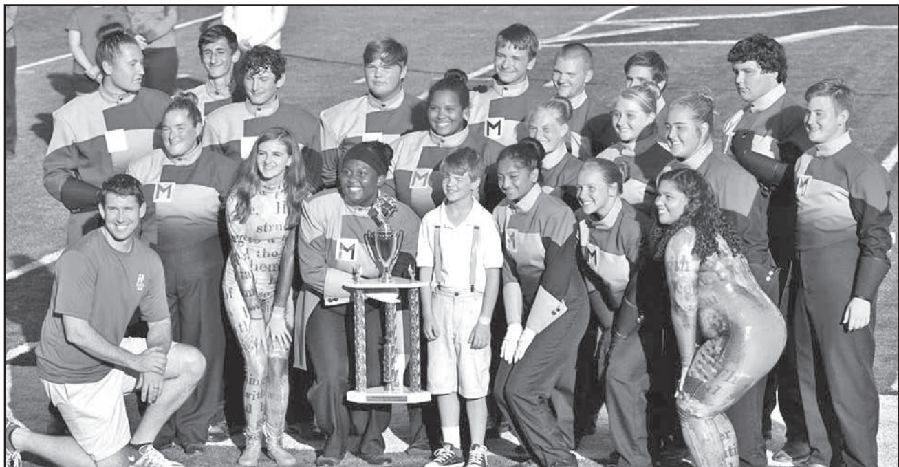
Section leaders and drum majors pose with a trophy earned at the Huntingdon competition. Each competition has different rules on who accepts awards for the band. Sometimes just the drum majors, sometimes all seniors, and sometimes the full band are present to accept their awards.